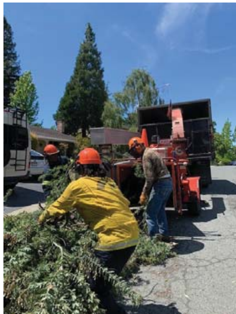
MOFD wood chipper on the job